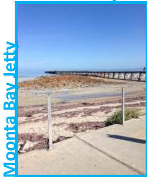
Moonta Bay Jetty

Port Hughes Jetty: Have a healthy meal at the pub or café or enjoy the playground. Drinking fountain, car park, toilets, and boat ramp are also nearby if needed.