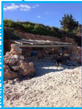
Rock & Wood Hut